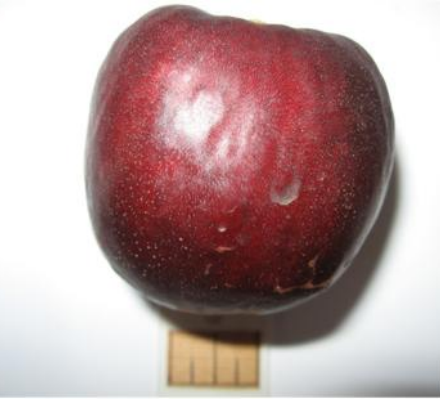
Figure 2. Fruit of nectarine 487-86

In world practice plants with anthocyanin coloration of leaves are widely used in ornamental gardening and small-stature clonal rootstocks are widely used (Usova, 1997; Romanov and Usova, 2007). Red leaf color is caused by anthocyans which alongside with chlorophyll and carotenoids are the main plant colorants of flavonoid group (Harborne, 1967; Harborne, 1976;Kulikov and Ivanova, 1976;Brouillard, 1993). The feature of red leaf color hasn't been studied sufficiently but at the same time it could be regarded as a universal method to increase agricultural plant productivity due to anthocyanins that take part in photosynthetic process of vegetal pigment. The interest in such non-traditional forms in horticulture arises in connection with the peculiarities of their functioning in the conditions of high temperature, moisture deficit and overall stability relating to productivity. Anthocyanins protect plants from ultraviolet radiation, increase frost resistance, rooting ability, asphyxiation and diseases and pests resistance (Romanov and Usova, 2007; Trutneva et al., 2012).